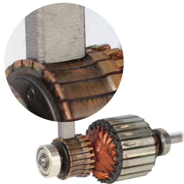
Motor after 1000 hours of runtime and conventional control